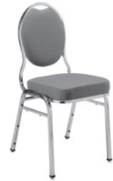
Boxed Seat Hourglass Back Stacking