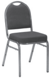
Domed Back Stacking