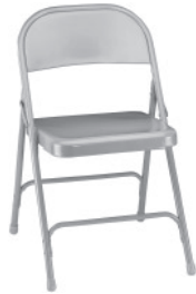
Single Contour Folding