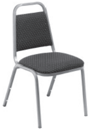
Tapered Back Stacking