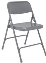
Double Contour Folding