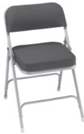
Padded Seat & Back Folding