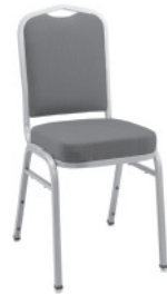
Boxed Seat Cathedral Back Stacking