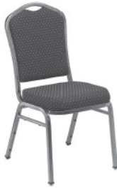
Silhouette Back Stacking