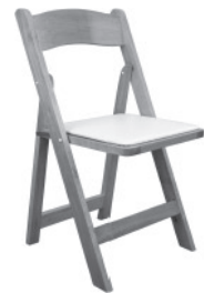
Wooden & Resin Folding