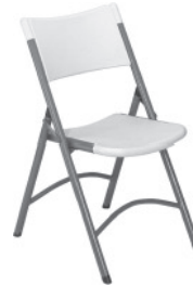
Blow Molded Folding