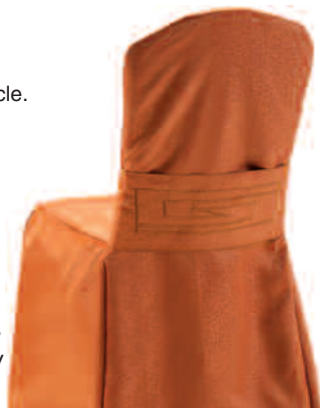
Chair Cover with Chair Band

Cool water wash. Tumble dry, low heat with cool down cycle. Remove promptly from dryer. Use steam iron on low setting.