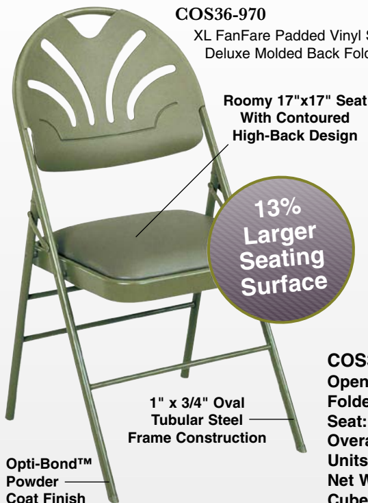
COS36-970 XL FanFare Padded Vinyl Seat and Deluxe Molded Back Folding Chair

Roomy 17"x17" Seat With Contoured High-Back Design