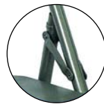
Strong Double Hinges

COS36-877 & COS36-870 Dimensions: Open: 18 1/2"W x 21 3/4"D x 35 1/2"H Folded: 18 1/2"W x 5 1/4"D x 44 1/2"H Seat: 15 3/4"W x 15 3/4"D x 19"H Overall Carton Weight: 47 lbs. Units Per Carton: 4 Net Weight: 11 lbs. Cube: 6