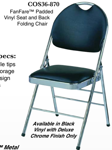
COS36-870 FanFare™ Padded Vinyl Seat and Back Folding Chair

Available in Black Vinyl with Deluxe Chrome Finish Only