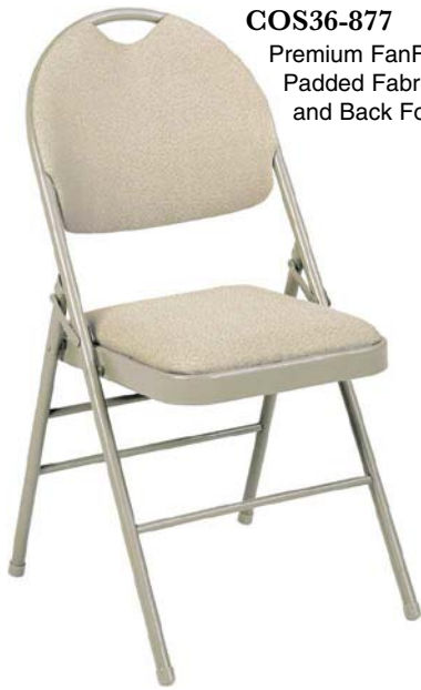
COS36-877 Premium FanFare™ Padded Fabric Seat and Back Folding Chair