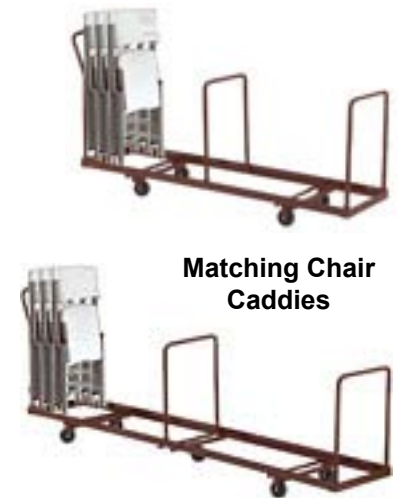
Matching Chair Caddies